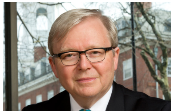
KEYNOTE SPEAKER THE HON. KEVIN RUDD President, Asia Society Policy Institute & Former Prime Minister of Australia